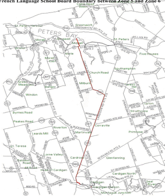
French Language School Board Boundary between Zone 5 and Zone 6